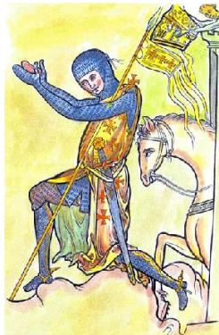
Crusader , c.1200-1250. Psalter, Litany, Office of the Dead; Compiled for Westminster Abbey. British Library MS2.A.XXII. Fol. 220r.