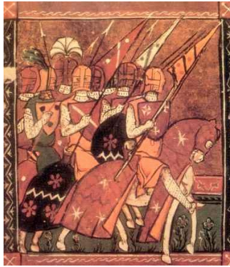
First Crusade: Godfrey of Bouillon leading his army (13th century, BN MS Fr. 9084, f. 20v)

Office hours: Thursdays 3:00-4:00pm - Robinson B 371B