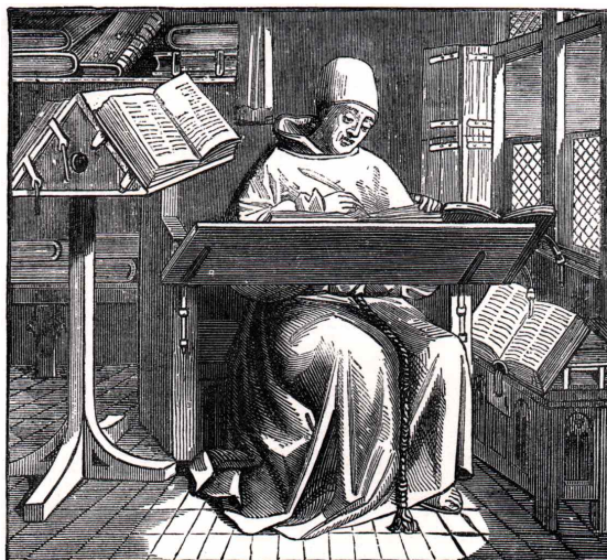
SCRIPTORIUM MONK AT WORK. (From Lacroix .)