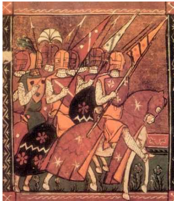
First Crusade: Godfrey of Bouillon leading his army (13th century, BN MS Fr. 9084, f. 20v)

This class is designed as part lecture and part discussion with emphasis on the interaction between the Christian East, the Muslim World and the Christian West. We will examine primary sources (in translation) and secondary sources that render a wide spectrum of ideologies and scholarship on the crusading movement. Emphasis will be on themes of cultural transmission, warfare and colonization between competing societies from Western Europe, Byzantium and the Middle East.