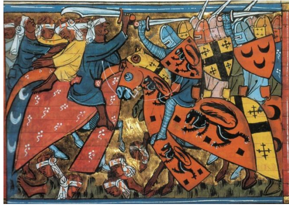
Crusaders fighting the Turks